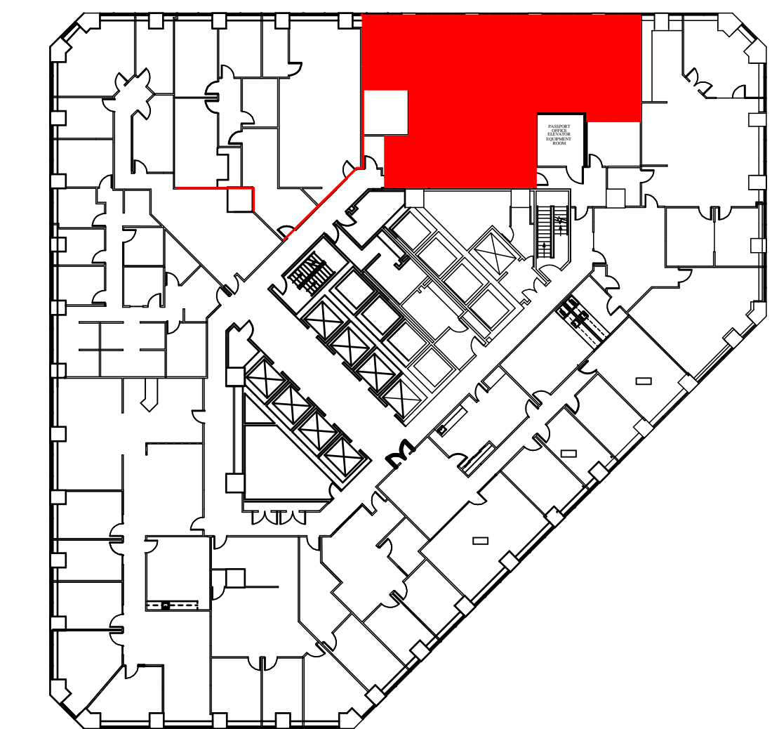
2 KEY MAP SS11.4 SCALE: 1/32" = 1'-0"