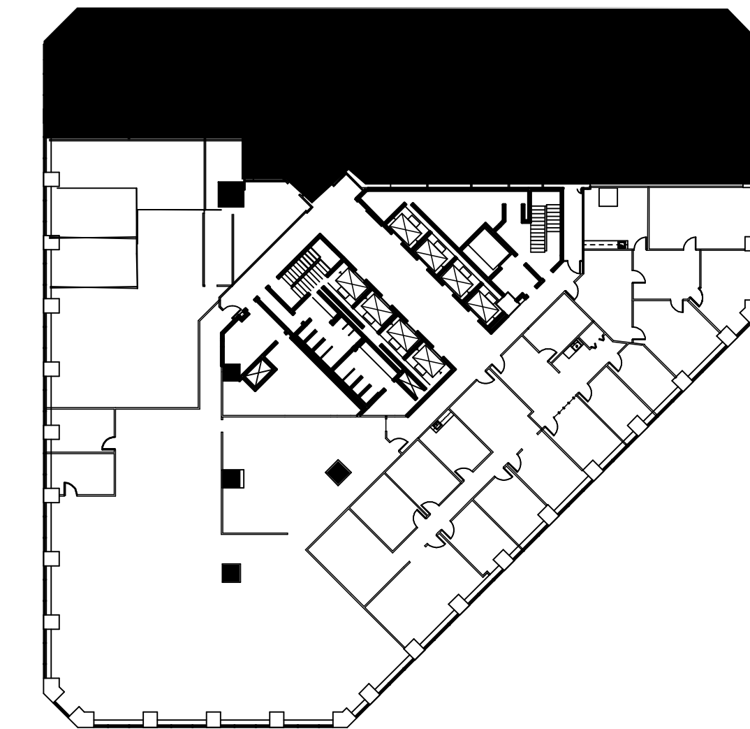
2 KEY PLAN AC22.1 NOT TO SCALE