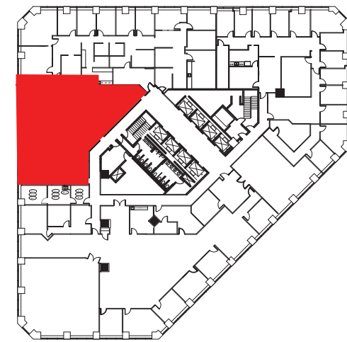
1 SPACE STUDY - REVISED SS23.1 1/4"=1'-0"