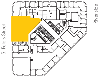
Canal Street (upriver view)